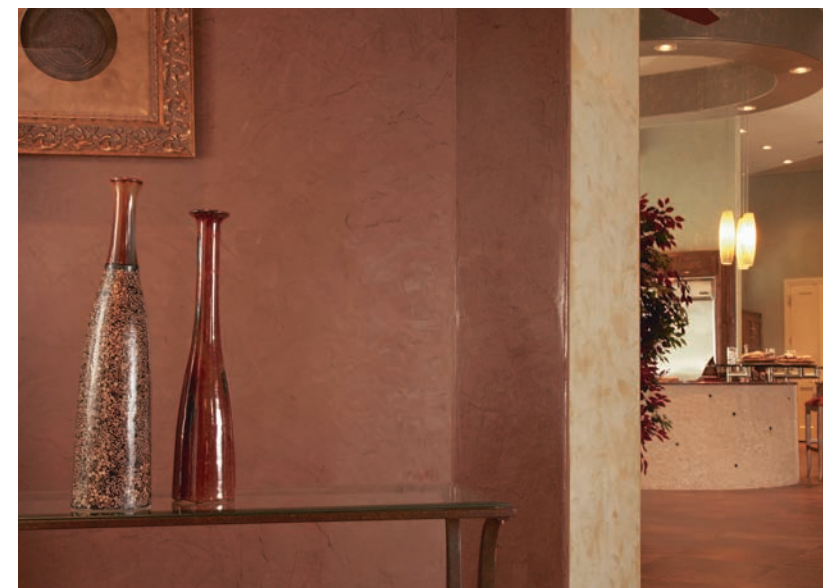
It's easy to create the look of an old-world artisan finish with the LaHabra Venetian Plaster.

These colors may vary depending on texture and application technique. For color verification, a sample in the color and texture should be made prior to ordering material. The contractor should provide a jobsite color sample prior to application.