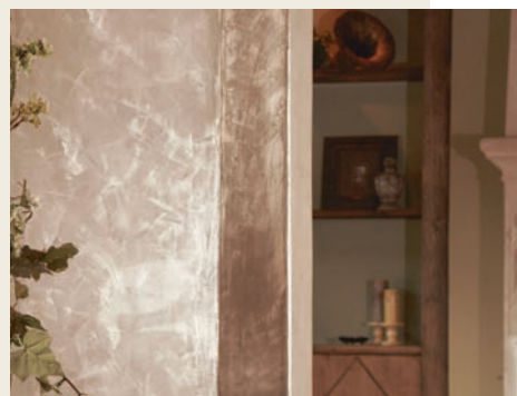
A pearlescent, Venetian Plaster finish adds elegance to any décor.