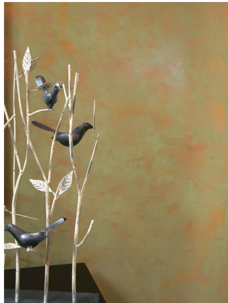
Venetian Plaster Topcoats can be used to create metallic highlights like those shown here where Copper, Aztec Gold and Bronze Topcoats have been applied over a Green Venetian Plaster Topcoat.